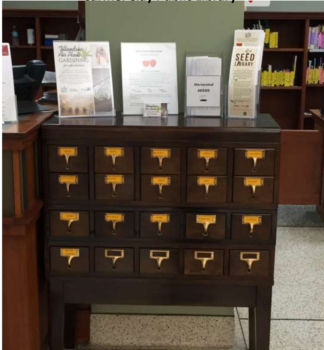
Carmel Clay Public Library